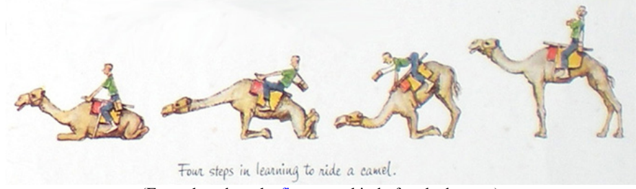
(From the ad on the first page, kind of tucked away.)